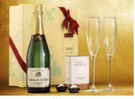
Stylish gift sets p20-21