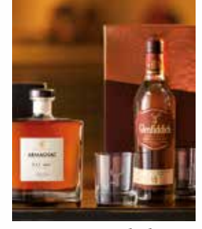
Gin, rum, whisky and more p18-19