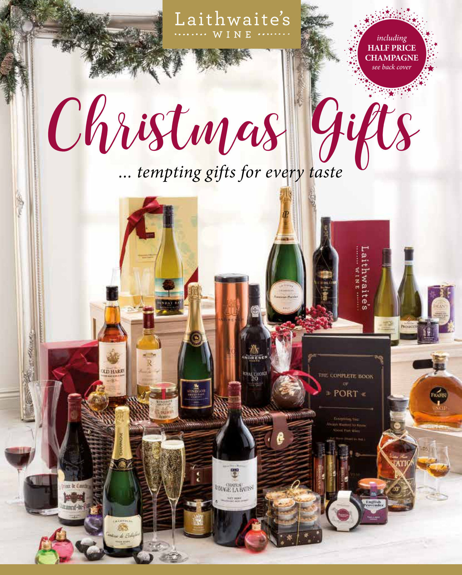
Order by 21st December for guaranteed Christmas delivery