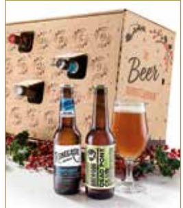
Advent calendars p23