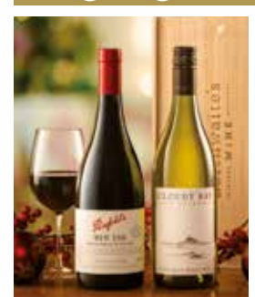
Perfect festive duos and trios p4-7