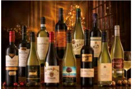
Specially selected mixed cases p12-15